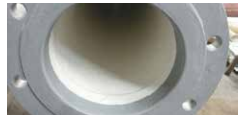
Before, during and after an application of Belzona 1381 being spin-sprayed on the internals of pipes

For more information, please contact your local Belzona representative: