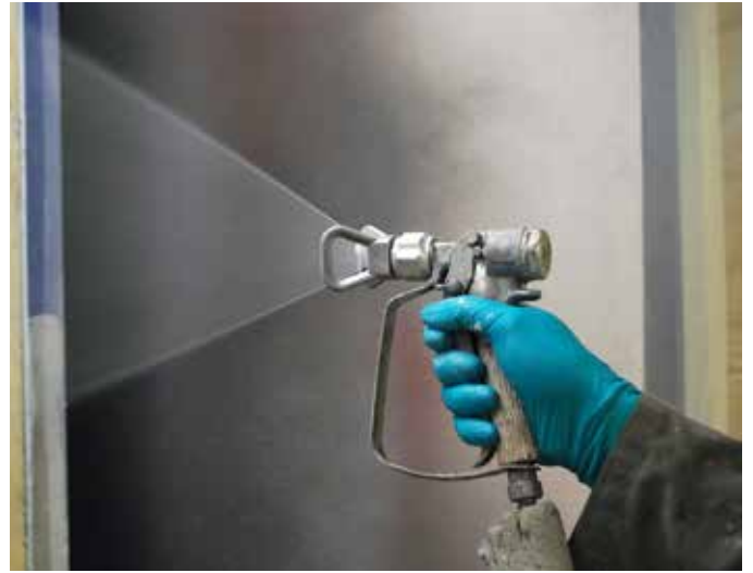
Belzona 1381 can be sprayed with negligible wear to the nozzle

Belzona 1381 is capable of high-build spray application (> 1250 microns) in a single coat without sagging.